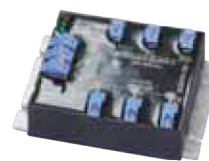
Solid state contactor for 3 phase motor. Dry contact control Spring terminals

This device using SSRs controls AC motors in hazardous area. Control by pushbutton with embedded magnet actuating Reed switches.