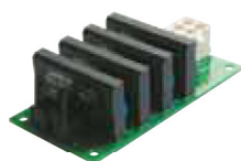
4 SKL Relays on PCB

In addition to the very large range of solid state relays, celduc® design specific products according to the customers specifications or adapt products to the customers needs if prices and volumes can justify such developments. Please do not hesitate to consult us.